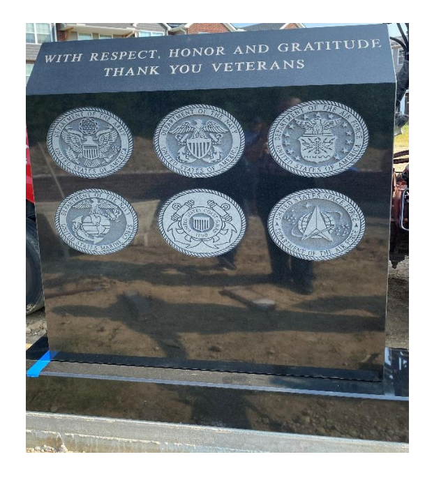
The Washington Memorial